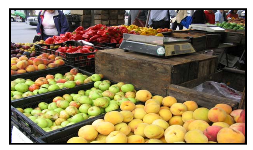
Produce vendor at Heart of the City Farmers Market