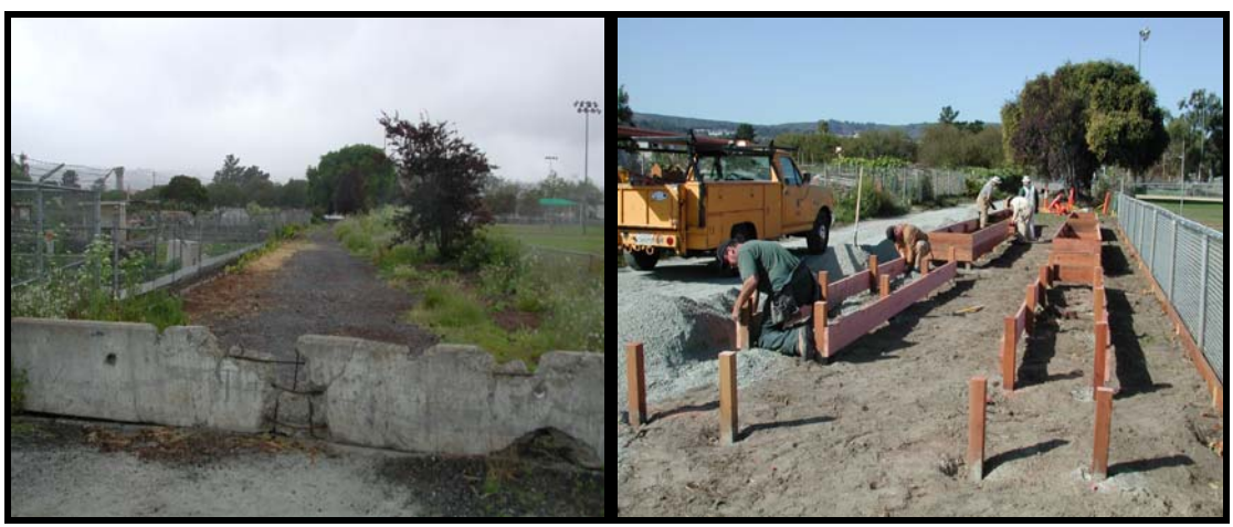
Underutilized SFO land in San Bruno