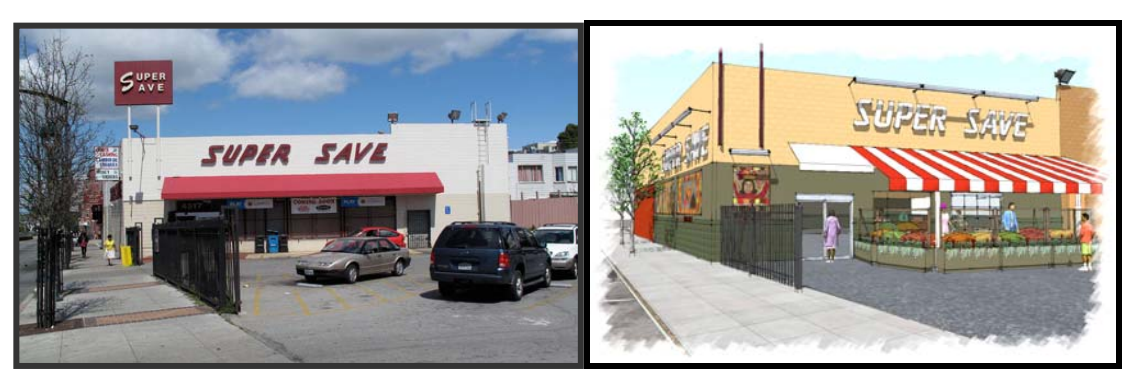
Super Save Market