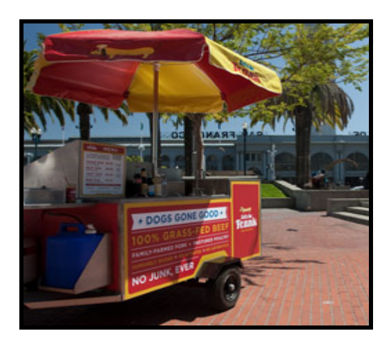
Let's Be Frank cart, featuring Grass fed beef hot dogs.