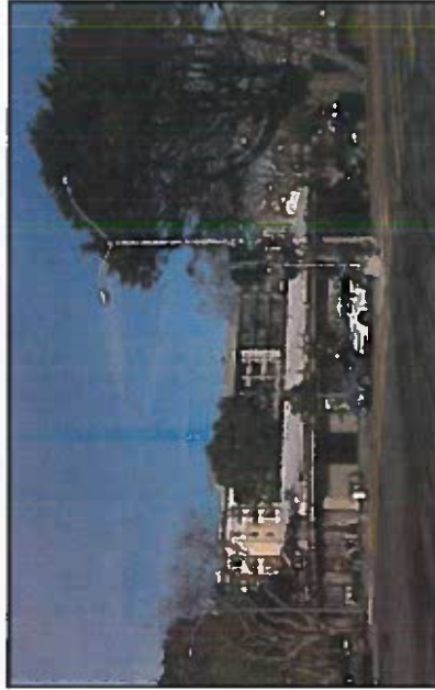
Photograph 4 - Geary Boulevard & Scott Street looking northeast.