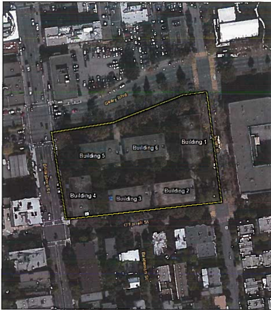
Imagery provided by ESRI and its licensors © 2014. Additional data layers from City and County of San Francisco Planning Department, 2014.