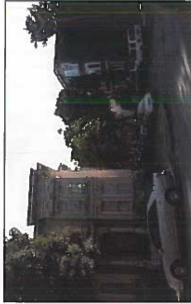
Photograph 2 - O'Farrell Street looking south.