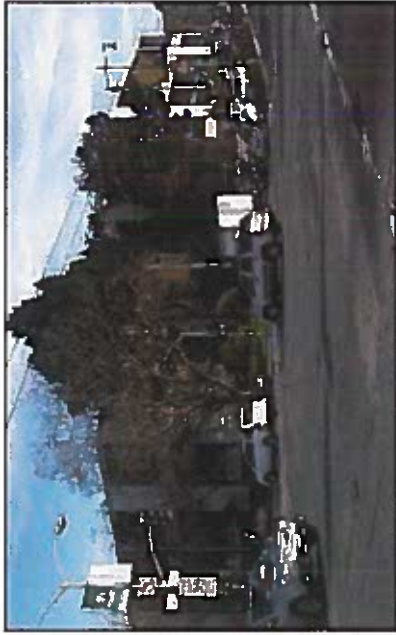
Photograph 1 - Geary Boulevard & Divisadero Street looking toward project site.