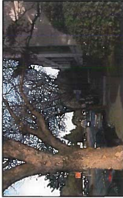
Photograph 3 - Geary Boulevard & Divisadero Street looking east.