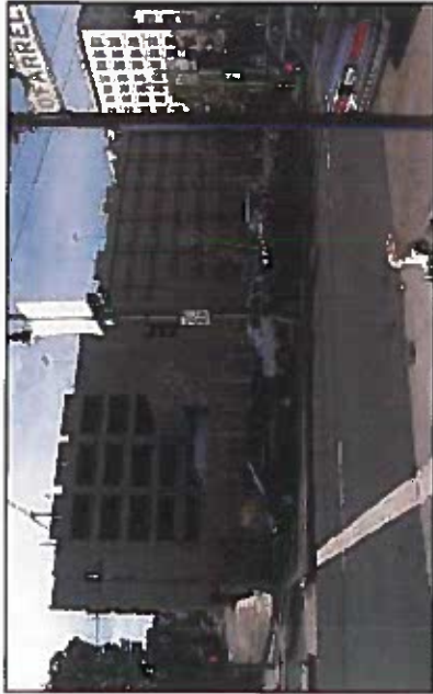
Photograph 1 - O'Farrell Street & Divisadero Street looking west.