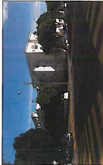
Photograph 3 - Scott Street & O'Farrell Street looking southeast