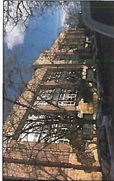
Photograph 4 - Scott Street looking southeast