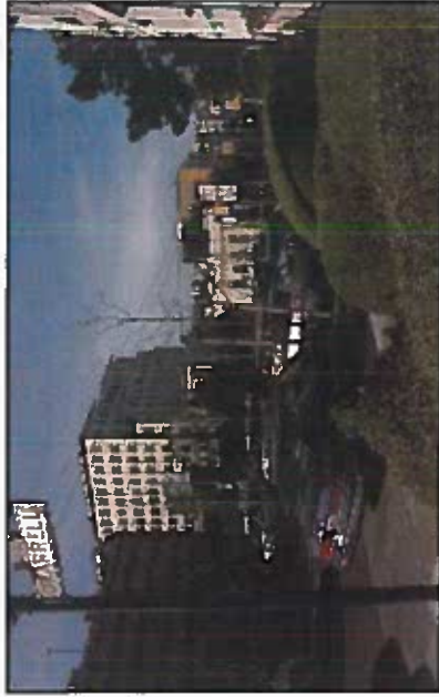
Photograph 2 - Of arrell Street & Divisadero Street looking northwest.