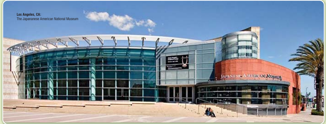
Los Angeles, CA: The Japanese American National Museum

Other Japantowns and cultural districts have used a number of techniques to preserve and share the history and qualities that make them unique.